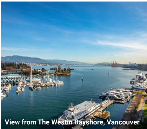
View from The Westin Bayshore, Vancouver