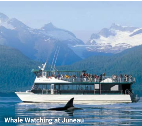
Whale Watching at Juneau