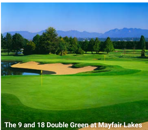
The 9 and 18 Double Green at Mayfair Lakes