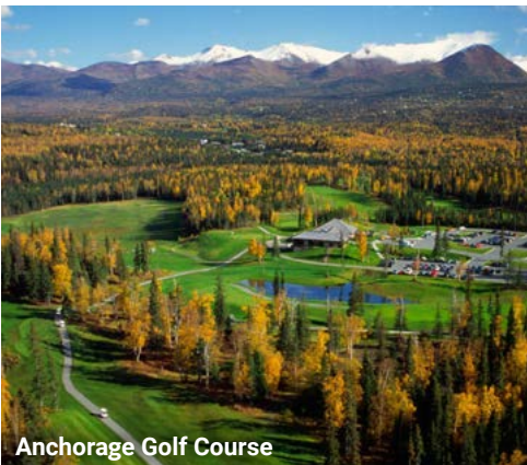
Anchorage Golf Course