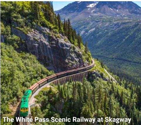
The White Pass Scenic Railway at Skagway