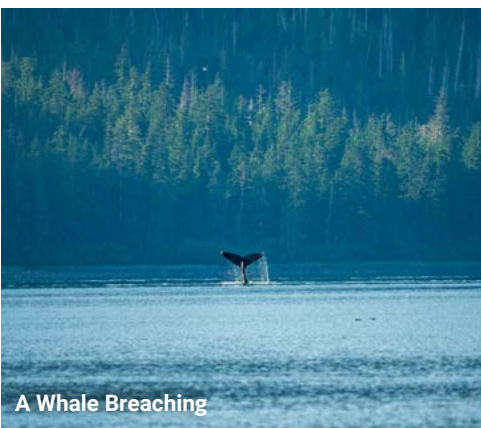
A Whale Breaching