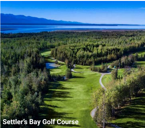
Settler's Bay Golf Course

We start the day at our home away from home - the Captain Cook Hotel, with breakfast, then the golfers will have an opportunity to play a truly special course.