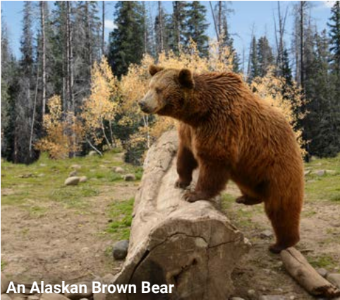
An Alaskan Brown Bear