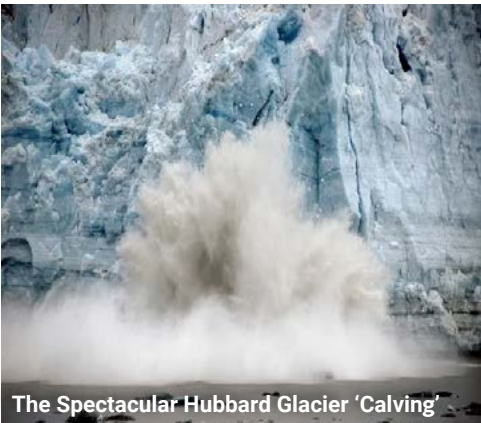
The Spectacular Hubbard Glacier 'Calving'