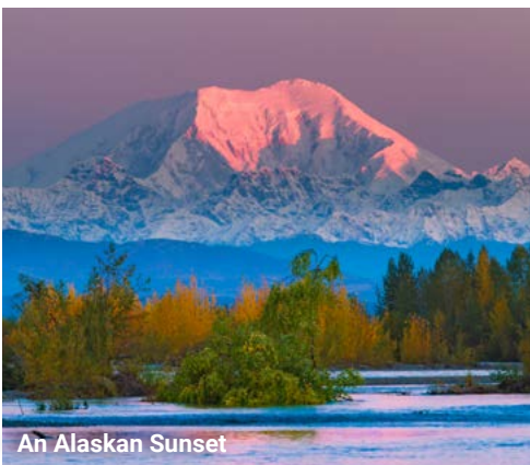
An Alaskan Sunset