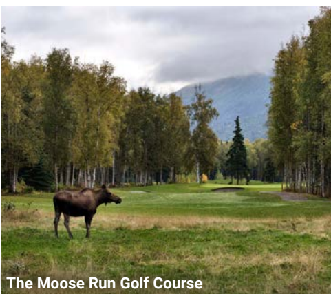
The Moose Run Golf Course