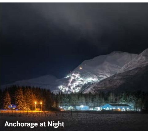
Anchorage at Night