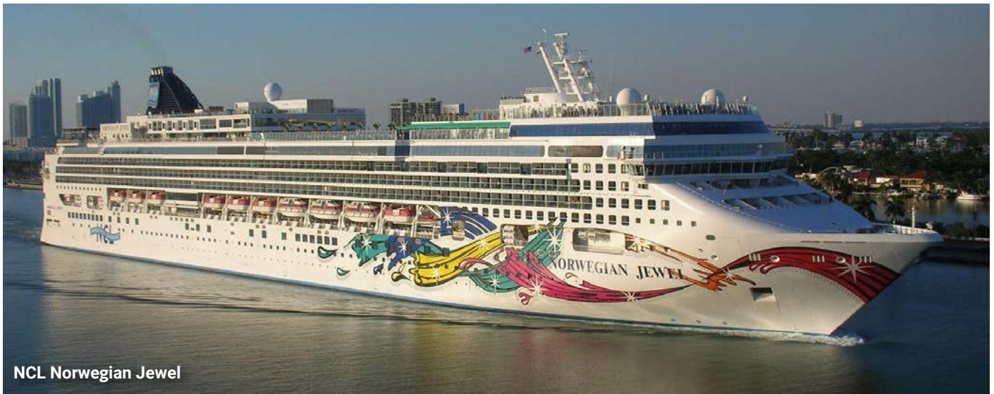
NCL Norwegian Jewel

After its two-week renovation period in Sydney for one of the most extensive renovations across the fleet in 2018, the namesake of NCL's "Jewel Class" cruise ships, the Norwegian Jewel has a large variety of dining options, vibrant bars and nightclubs, and that's just the beginning.