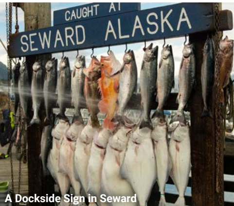
A Dockside Sign in Seward