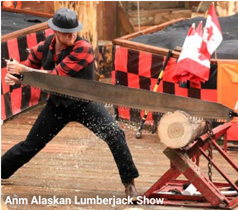
Ann Alaskan Lumberjack Show