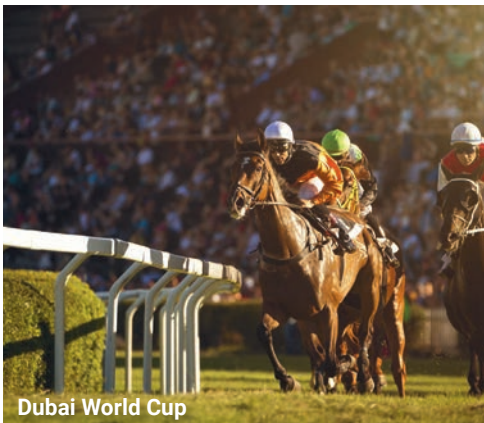
Dubai World Cup