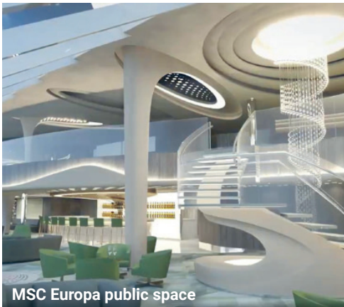
MSC Europa public space