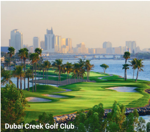
Dubai Creek Golf Club

The par 71 course at Dubai Creek that measures 7,009 yards is a memorable journey from the first tee to the 18th green. The superbly manicured fairways undulate like gentle waves, defined by palm trees and water. Apart from the Creek, which comes into play on at least four holes, several artificial lakes add to the beauty and difficulty of various other holes.