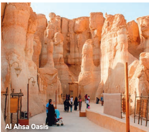
Al Ahsa Oasis

(B,L,D w drinks) Cruise Ship: MSC Europa