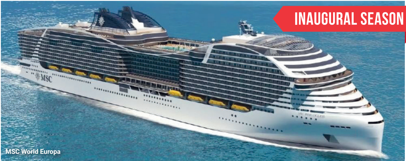
MSC World Europa

Imagine the future of cruising on board the new revolutionary MSC World Europa, the first ship trailblazing MSC World class fleet. The ship reflects MSC Cruises' firm long-term environmental commitment and responsibility to the future. It features ground-breaking design, where every detail is conceived to offer you a taste of a new cruising experience.