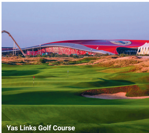
Yas Links Golf Course