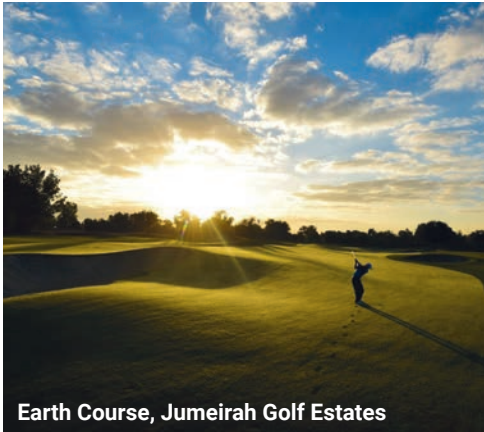
Earth Course, Jumeirah Golf Estates