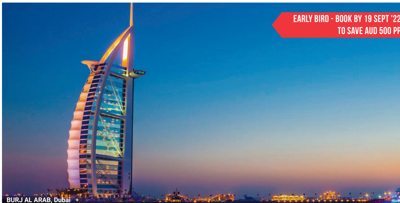
BURJ AL ARAB, Dubai

EARLY BIRD - BOOK BY 19 SEPT '22 TO SAVE AUD 500 PP