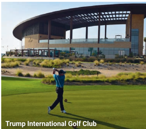
Trump International Golf Club