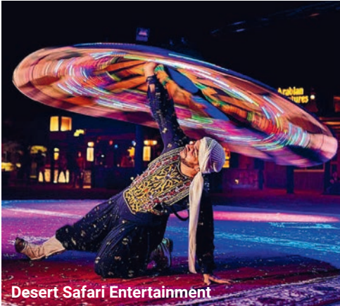
Desert Safari Entertainment

This afternoon, we're off to a sunset desert safari . You will begin with a private, chauffeured 4-wheel drive vehicle into the desert. With a few stops for some sandy happy snaps along the way, we'll reach our campsite in time to watch the sun sink below the horizon and enjoy various activities and a delicious barbecue dinner with shisha before watching a starlit dance performance. The night sky in the desert is just dreamy!