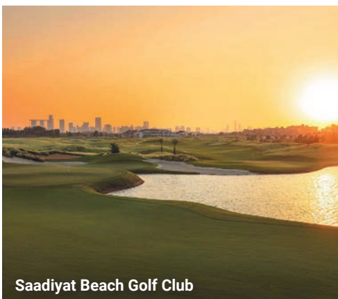
Saadiyat Beach Golf Club