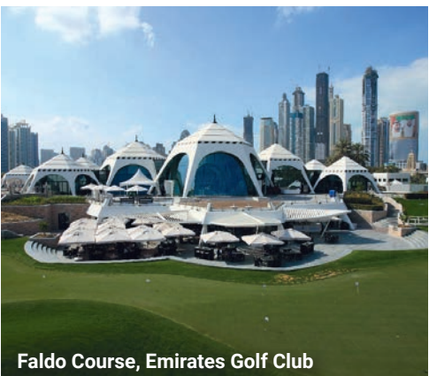
Faldo Course, Emirates Golf Club