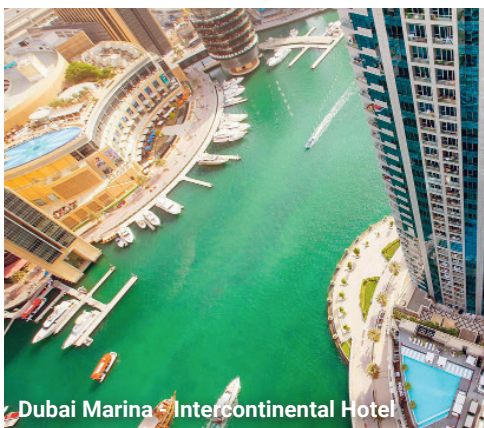
Dubai Marina Intercontinental Hotel

First run in 1996 - the Dubai World Cup has become the world's richest race with a purse of over $12 million. The full day features nine races with a total of $30 million in prizes.