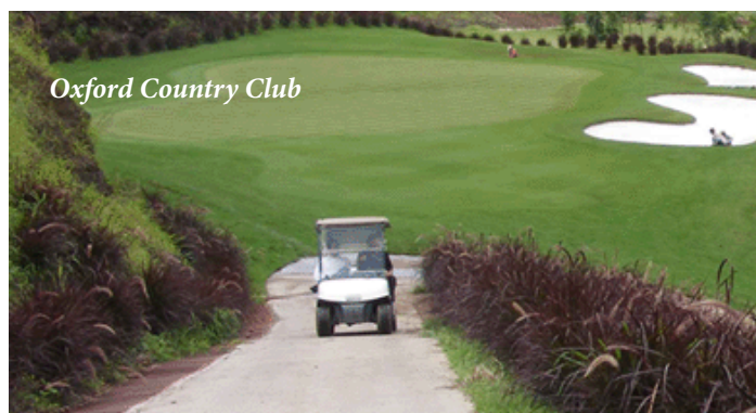
Oxford Country Club