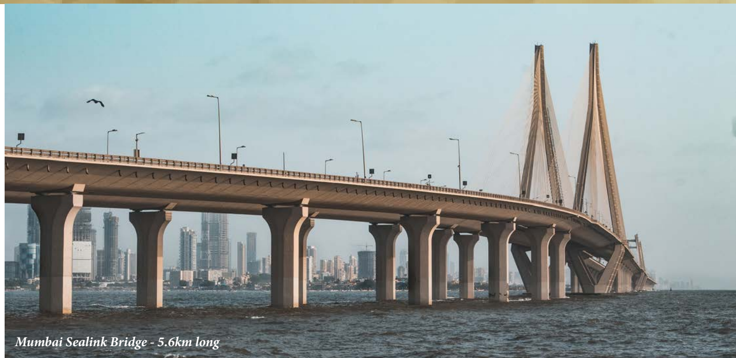
Mumbai Sealink Bridge - 5.6km long