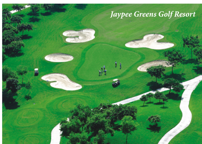
Jaypee Greens Golf Resort