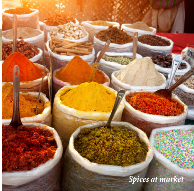
Spices at market