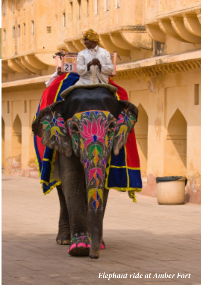
Elephant ride at Amber Fort