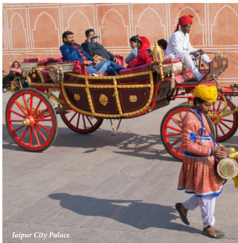
Jaipur City Palace

Go Golfing's Luxury Collection is reserved for tours of spectacular quality and luxury. You will stay at luxury hotels imbued with a sense of history and culture. Those hotels will offer you the comforts of a luxurious home and the opportunity to savour an extensive array of international cuisines together with Indian specialties. Your comfort and safety is guaranteed. This is more than a golf tour; it is a journey you will cherish forever.