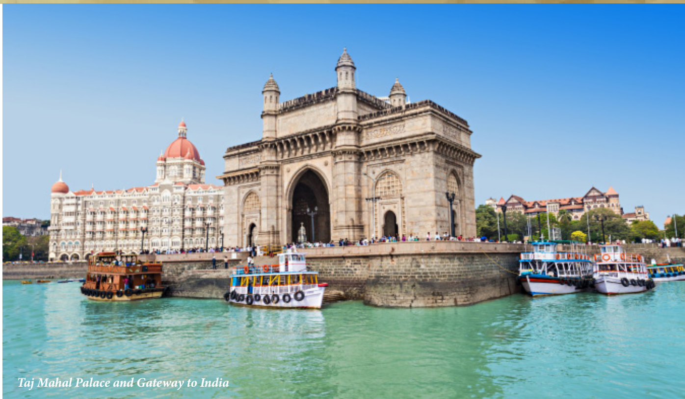
Taj Mahal Palace and Gateway to India