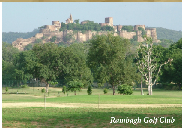
Rambagh Golf Club