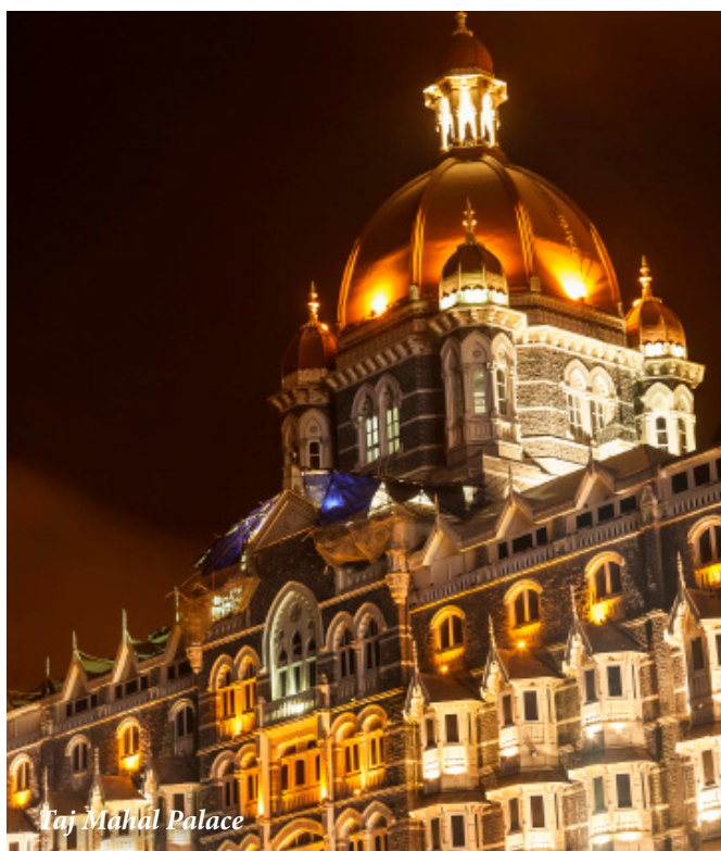
Taj Mahal Palace