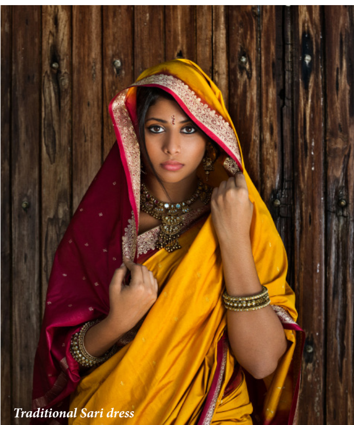
Traditional Sari dress